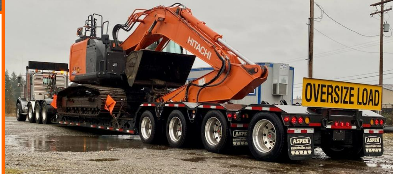
ROLLING OUT THE NEW LOWBOY