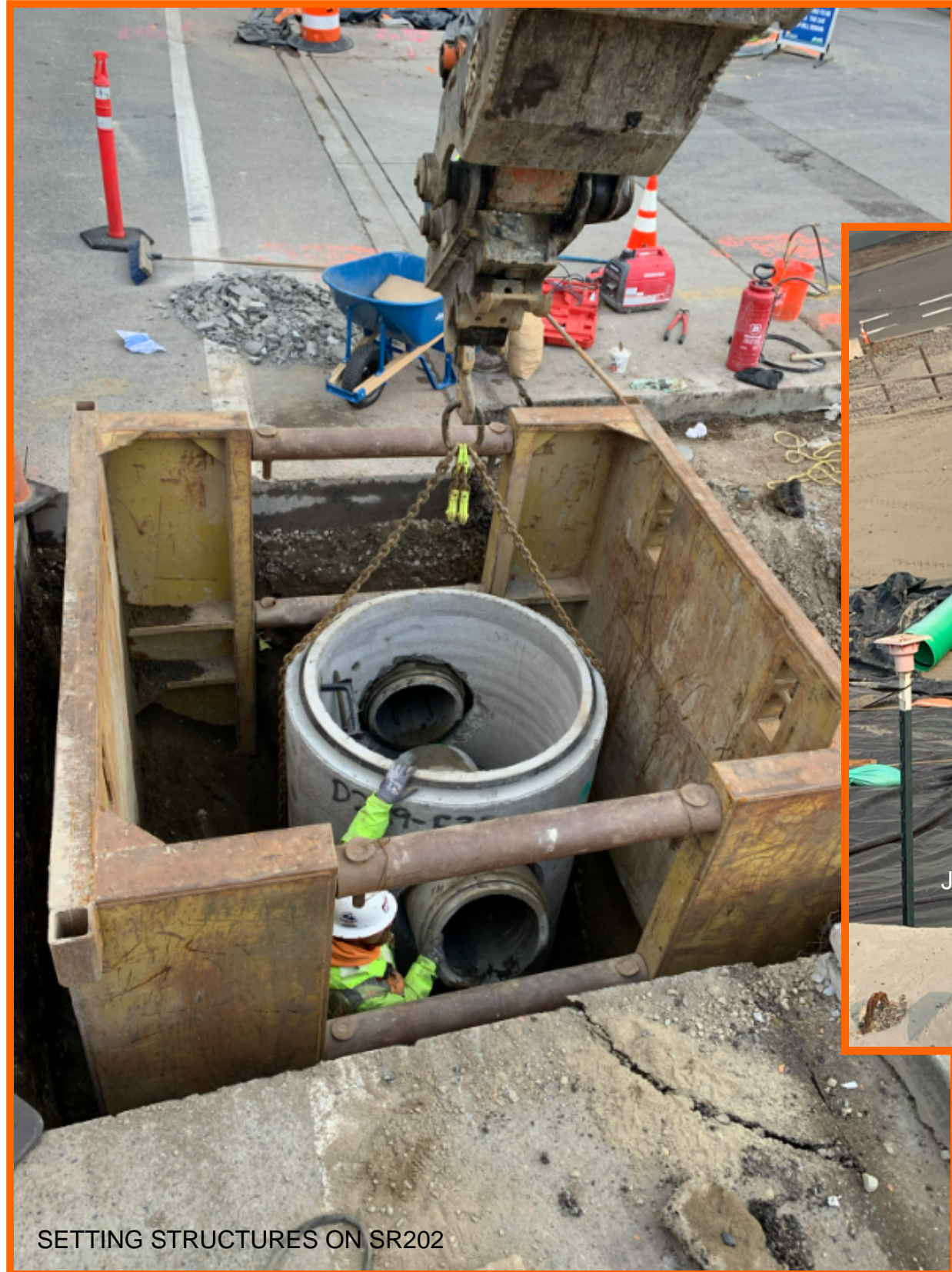
SETTING STRUCTURES ON SR202