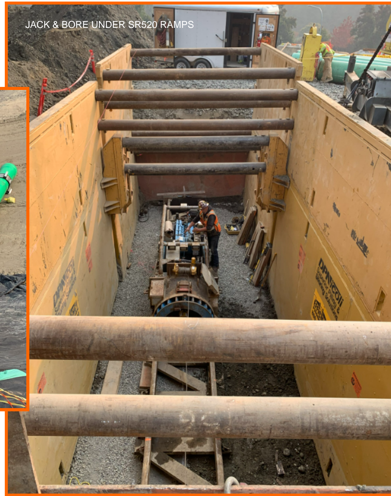
JACK & BORE UNDER SR520 RAMPS