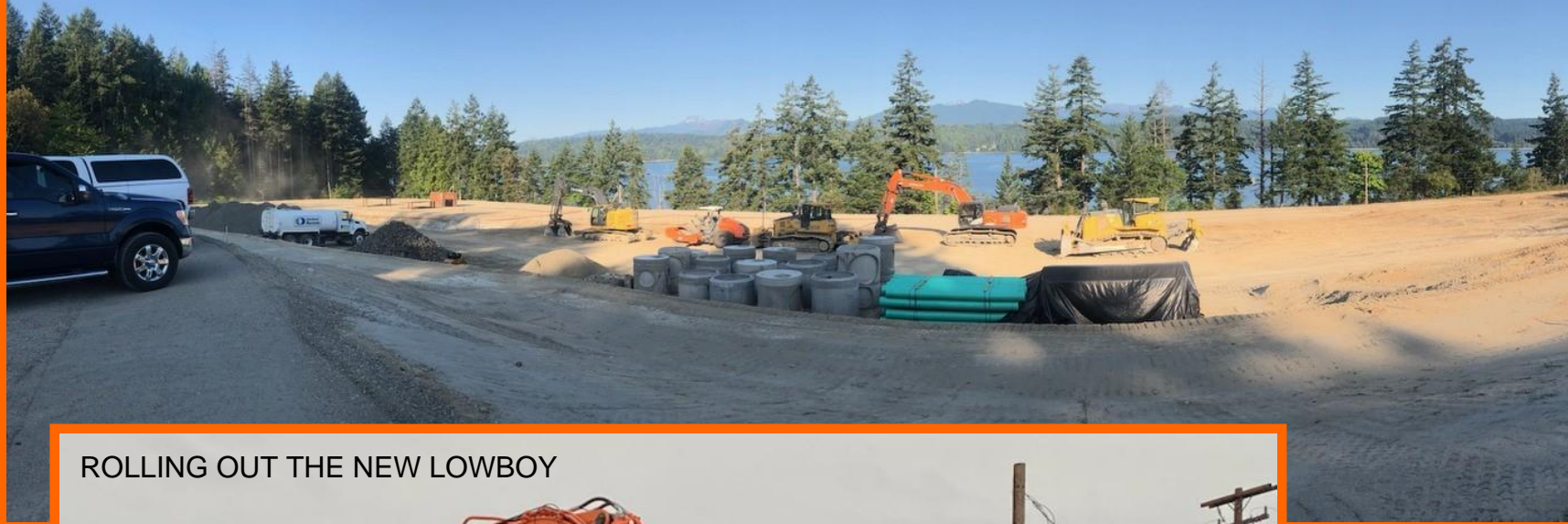
ROLLING OUT THE NEW LOWBOY